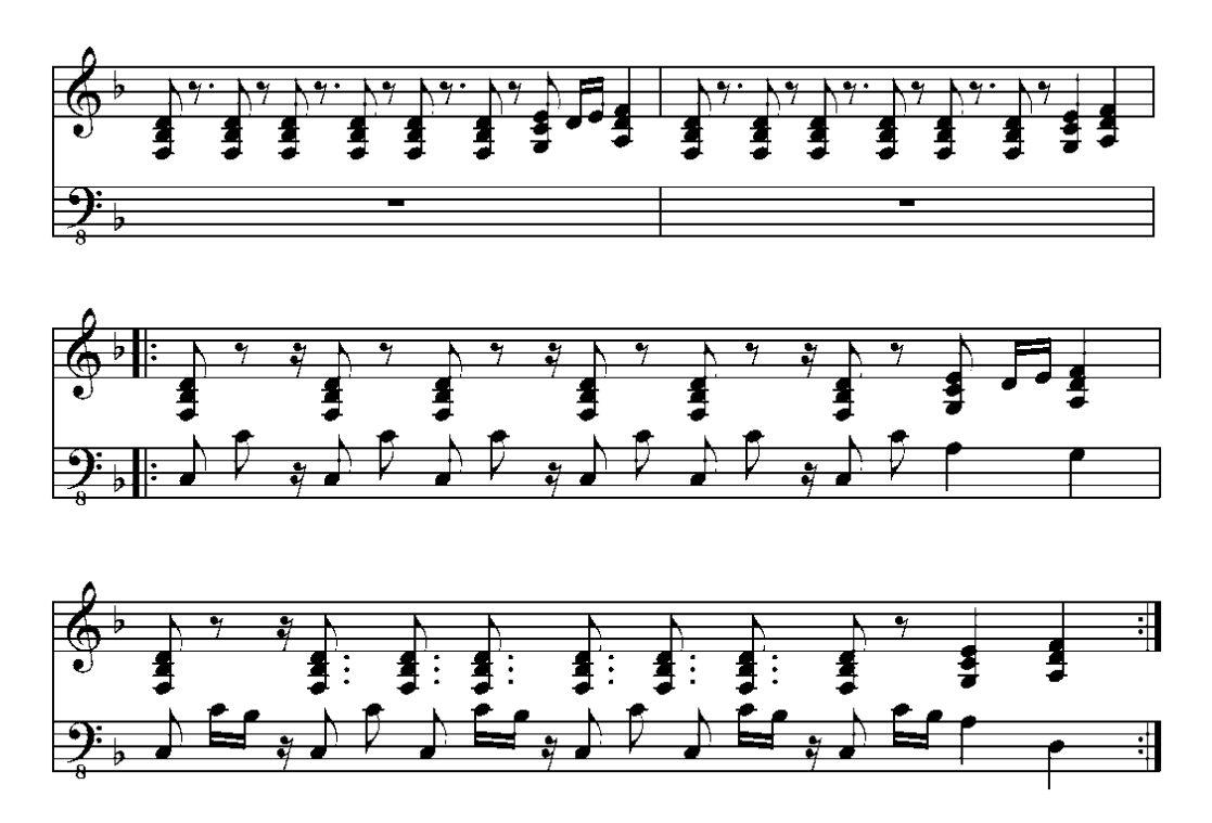
Example 1. Avishai Cohen »One For Mark« (2006), first six cycles, piano and bass part only; in the fourth and sixth cycle the drums play the same accents as the piano.