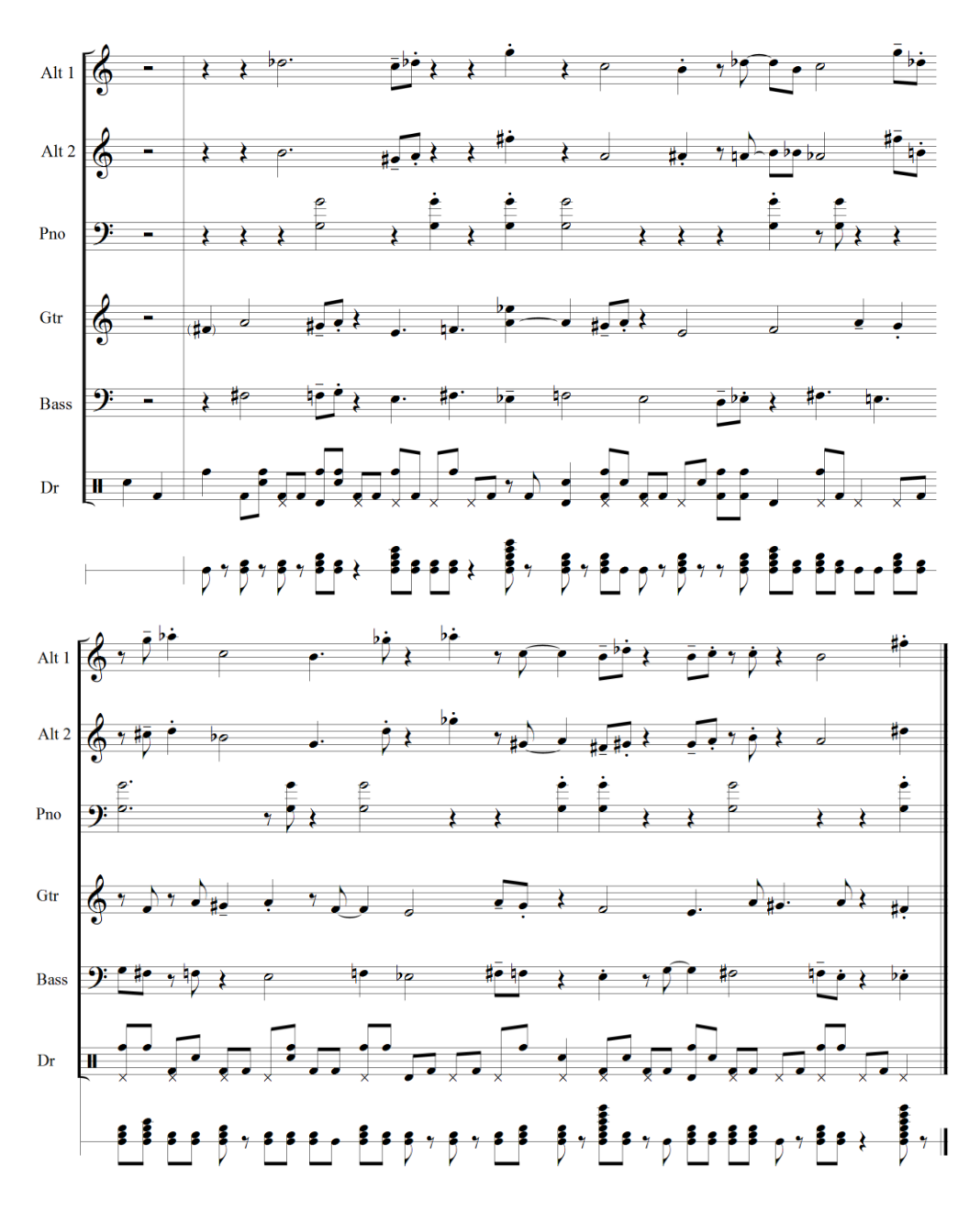
Example 4. Steve Coleman »Cross-Fade«, score (Coleman 2002) without bar lines; the rhythm profile below each system results from adding the number of tone onsets in all the instruments except the drums.

(see Müllensiefen/Frieler/Pfleiderer 2009). Moreover, Petersen completely ignores learned metric schemes, which could easily lock into place while listening to music. On the other hand, a rhythm score can be very helpful in providing a vague impression of a rhythmic texture and its factual regularities. In the rhythm profile of »Cross-Fade« (see Example 4) only the onsets of the various instruments are summed up—except for the drums, which are omitted, since the drum part plays almost every eighth note, and it is hard to determine which of the manifold drum components are the most salient.